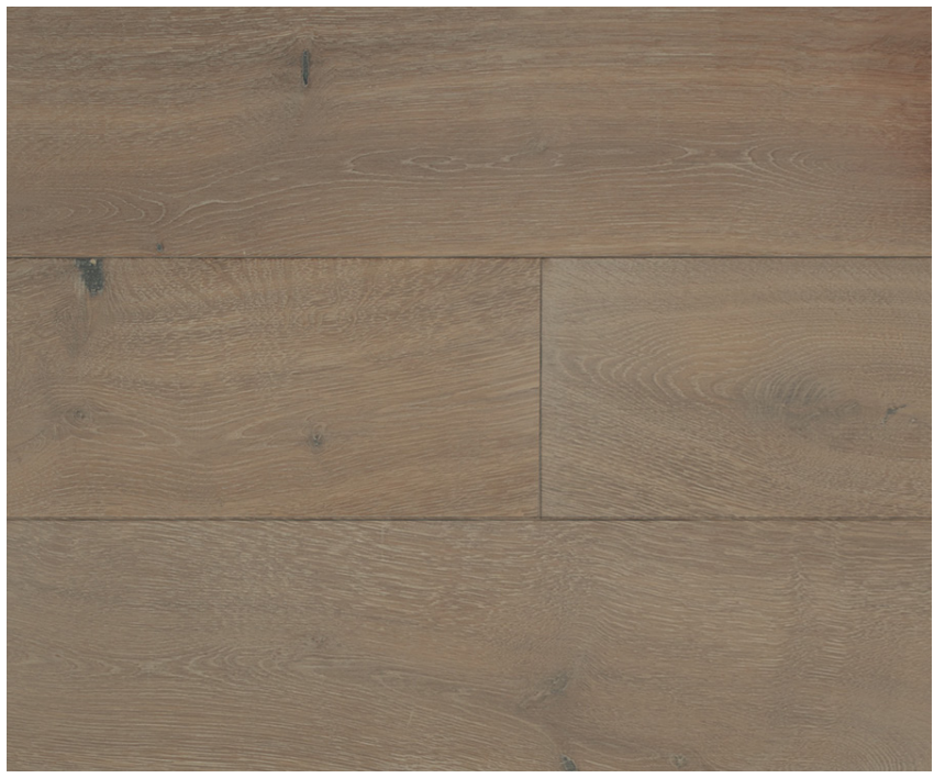
Your floor may vary due to color treatment, natural tannin variations and knots.

Height: 3/4" Length: 71" RL All dimensions are nominal